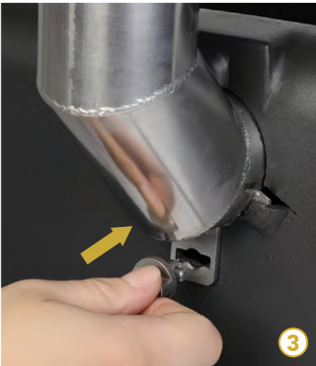
To ensure the flue doesn't loosen, insert locator pin.