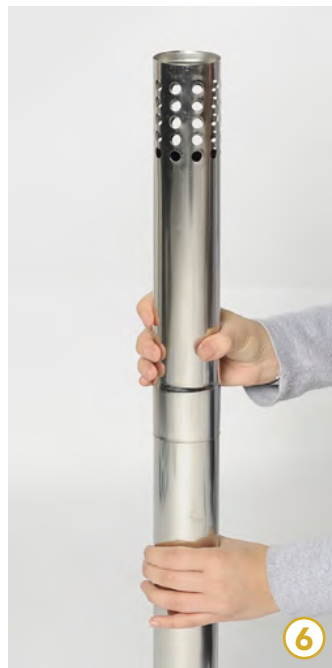
Connect the spark arrester. This reduces the risk of hot embers leaving in the flue.