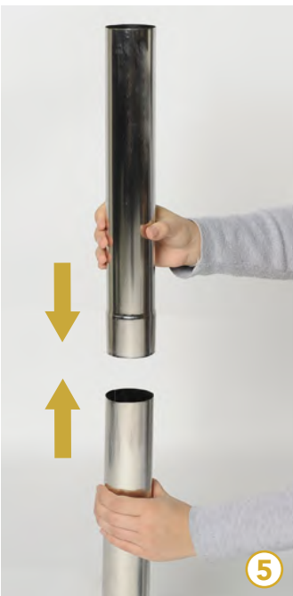
Connect all of the provided flue pieces. It is important that all extensions are used.