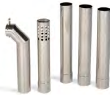
FLUE WITH SPARK ARRESTOR