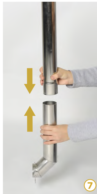
Lastly, connect complete flue assembly to the elbow bend or top of flue oven depending on configuration.