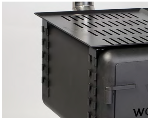
Flat / Grill plates can also be used over the firebox