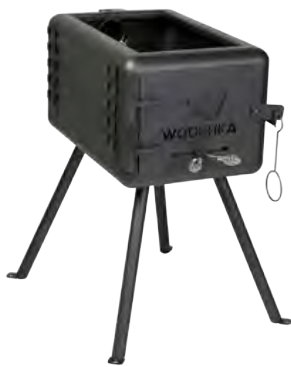
WOOD FIRED OUTDOOR STOVE WITH FIRE GRATE