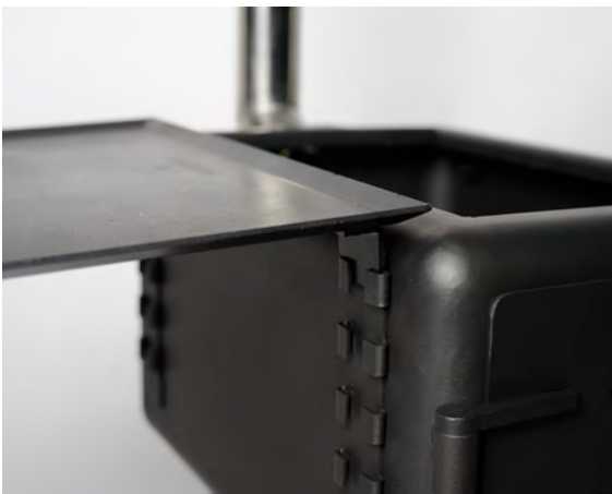
Insert locating tab onto side of the firebox