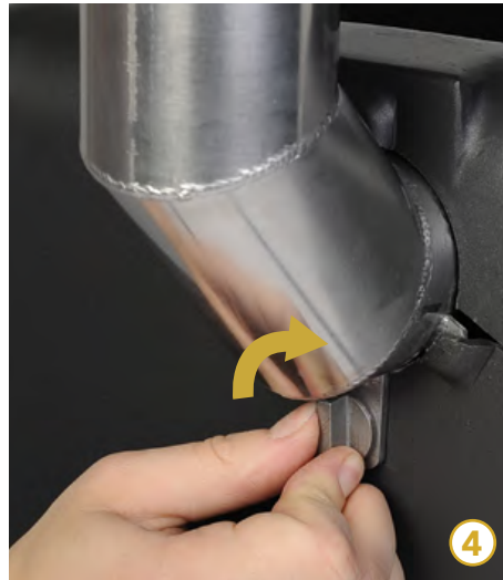
Rotate pin clockwise to lock into place.